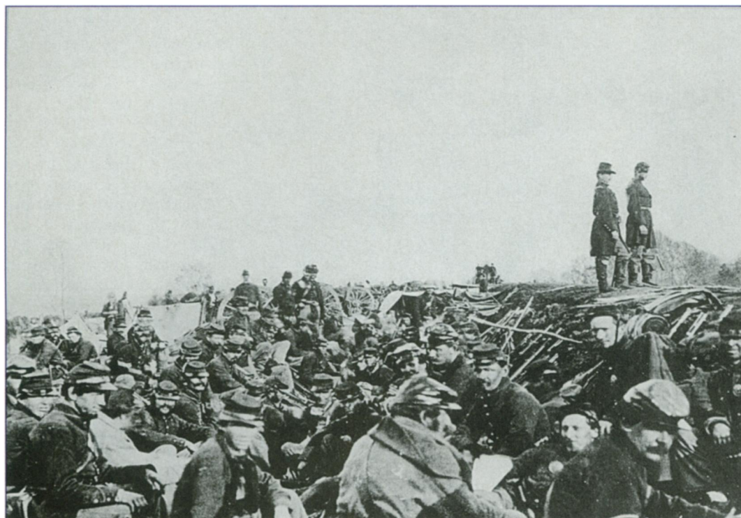
Union soldiers wait in a trench before joining the Battle of the Crater, near Petersburg, Virginia, in December 1864. Civil War armies combined Napoleonic tactics with new technology and earthworks such as trenches, which “would culminate in horrors” during the war.

Slavery was the first, most powerful, and most widespread kind of globalization in the first three centuries after Columbus. While colonies came and went, while economies boomed and crashed, slavery relentlessly grew—and nowhere more than in the United States. By the middle of the nineteenth century, the slave South had assumed a central role on the world stage. Cotton emerged as the great global commodity, driving factories in the most advanced economies of the world. The slaves of the South were worth more than all the railroads and factories of the North and South combined; slavery was good business and shrewd investment.